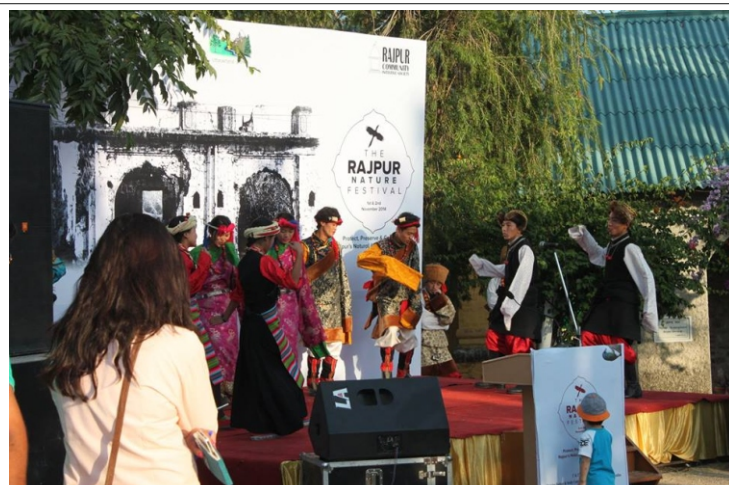
Himalayan Fair Trade Handicrafts Pvt. Ltd, Dehradun took part in Rajpur Community Initiative Fest on 1st and 2nd November 2014 at Christian Retreat and study center Rajpur. The Fest emphasised on clean and green Rajpur.