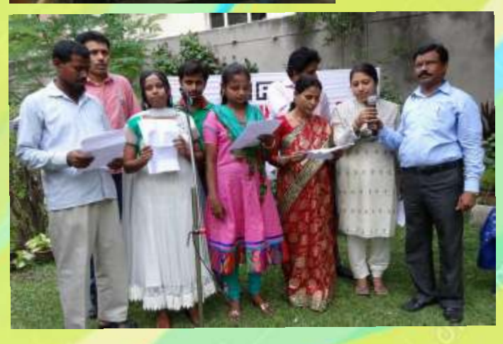
CRC Exports, Kolkata celebrated WFTD with their team at CRC office. The program was a combination of Fair Trade product displays and sale, games, sports, song presentations and discussions...

importance of a healthy lifestyle. They also conducted awareness workshop for men and women producers where they explained them about Fair Trade and its goals to work for their rights. They also created few promotional and visibility communication materials like 'I Support Fair Trade Call Out' placards for their shop to mobilise the customers visiting the 'Karigar' shop on WFTD.