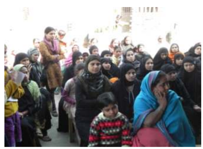
Parent-Teacher Meeting at Labour Colony, Ferozabad

One centralized teachers training was organized in Literacy India – Neb Sarai Centres. All teachers in the centre participated in the training organized by Literacy India resource persons. The training was a continuation of the series of training on effective methods of teaching. The teachers were trained to operate the computers and effectively run the software "GyanTantra" which is interactive educational software that helps the children learn and understand the subjects in an interactive way. Nine Youth group meetings