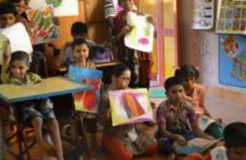
Various activities being held at WFTD, organised by Sasha, Kolkata

better producers' livelihoods the Fair Trade way. The signature campaign was a big draw in the Forum Mall (9<sup>th</sup> May) which attracted crowds in huge numbers. It aimed at sensitizing and creating awareness by displaying SASHA products. The motivated first time consumers supported the drive whole heartedly and enthusiastically! Special mention needs to be made of SASHA FaceBook profile that kept pace with the happenings in and around the organization. The true advocates of Fair Trade, i.e. the people behind the product and the consumers were given prominence. The World Fair Trade Day event finally peaked with the Coffee Meet at Sasha Shop. Our "Friends of Sasha" privilege card offer for committed customers and patrons was launched on the 10<sup>th</sup> of May to mark the World Fair Trade Day and we welcomed the loyal customers to a friendly and an informal social