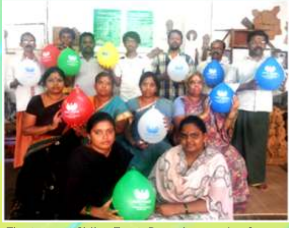
The team at Shilpa Trust, Bangalore posing for a groupie on WFTD..