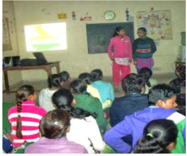
Youth Group Meeting at Nangloi

were held in in Bhatti, Bahadurgarh, MeenaGali, Shiv Gali, Reipura, LaborColony, NikaonCenters.