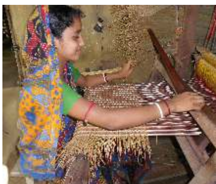
Women artisans at work in CSWS

CSWS organised various capacity building and market access programs for artisans during the period January to March with the support of various state and central government departments.