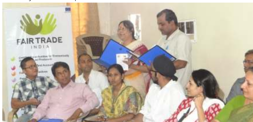
An activity in the workshop