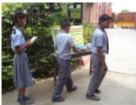
Activities in the Green Education campaign

Workshop on 'Role of women in development': A workshop on 'Role of women in development' was organized by SETU at Barmer, Rajasthan on the occasion of International Women's Day. Women artisans who do embroidery, stitching and appliqué work participated in the workshop. Issues such as domestic violence, deprival of opportunities for education and lack of participation in decision making in the family were discussed in the workshop. It was found that a lot of the participant women were suffering from domestic violence.