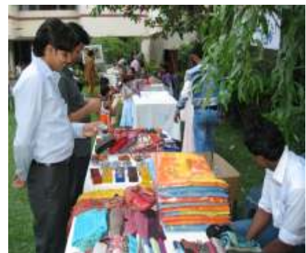
Fair Trade product display organised by CRC

Rescue, Equitable Marketing Association, Madhya Kalikata Shilpangan, Sasha Association for Craft Producers, Ruro Agro Services Association and Silence. Signature Campaigns were also organized in support of Fair Trade at Forum Mall in Kolkata and various other Fair Trade Shops. Various craft products were displayed, along with Fair Trade banners and posters. Enthusiasts—both young and old, showed keen interest and joined the campaign. People were also gifted Fair Trade merchandise like t-shirts, diaries and pens. CRC Exports, Kolkata also celebrated the World Fair Trade Day celebration