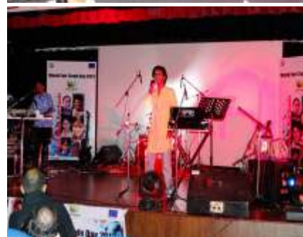
Jhoom Band performing at the event

Goan songs, bringing in the essence of the sand and sea with a tinge of Indian music. The audience was highly thrilled and joined the fun and frolic by dancing to the songs played by Jhoom. Overall, the program was a success, an amalgamation of cognisance and entertainment.