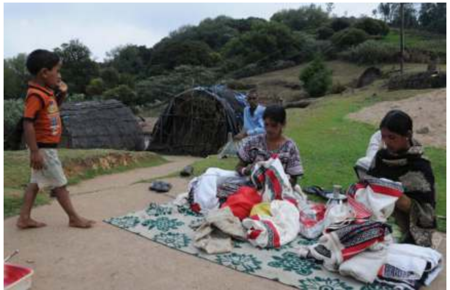
Artisans doing Toda embroidery