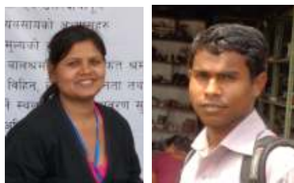
FK Fellows from India

had comprehensive experience and hands-on training and exposure through their engagements with various FTF-I members and the network itself. Asha Handicrafts, Conserve, Creative Handicrafts, Hansiba (Shop owned by Sewa-TFC), JKSMS, Kala Aparajita, Literacy India, Mesh, Pushpanjali, Sasha, Tara and Umang were the FTF-I member organisations in which the FK fellows came to India were posted this year. The FK Fellows were given opportunities to learn important areas of business such as brand promotion, retailing, packaging of products, product designing, visual