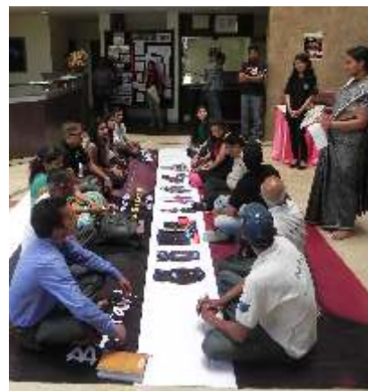
(Left) Distribution of certificates to participants of workshop on packaging. (Right) Training of recycled paper bag making