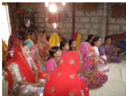
Workshop on 'Role of women in development'

'Green Education Campaign': World Earth Day & World Books Day: SETU organized a fortnight long 'Green Education Campaign' in 15 renowned schools of Jaipur, on the occasions of World Earth Day (April 22nd) and World Books Day (April 23rd). The students were motivated to follow the principle of 3Rs - 'Reduce, Reuse & Recycle' and understand the importance of preserving natural resources. The students were encouraged to follow intelligent usage of paper so that a lot of trees can be saved from felling. The students were asked to deposit their old notebooks (with used as well as blank pages) at their school counters. The left over pages of old notebooks were collected and segregated from 10th to 25th April by the SETU team and rebound to form new notebooks. A total of about 14000 children participated in the campaign!