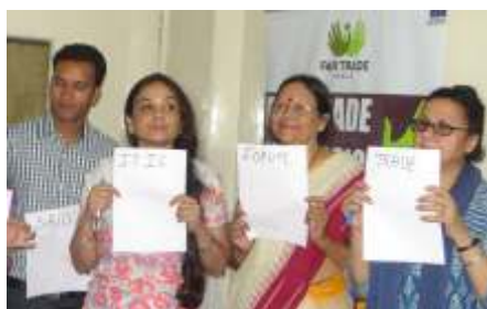
An activity in the workshop

The training covered the core modules on— Customer Service & Retail Selling Skills, Store Operations (Store Profitability/KPIs, Team Bldg/Goal setting) and Visual Merchandising and In-store operations. There were also a few live and interactive sessions on Communication Skills, Personality Development and Grooming.