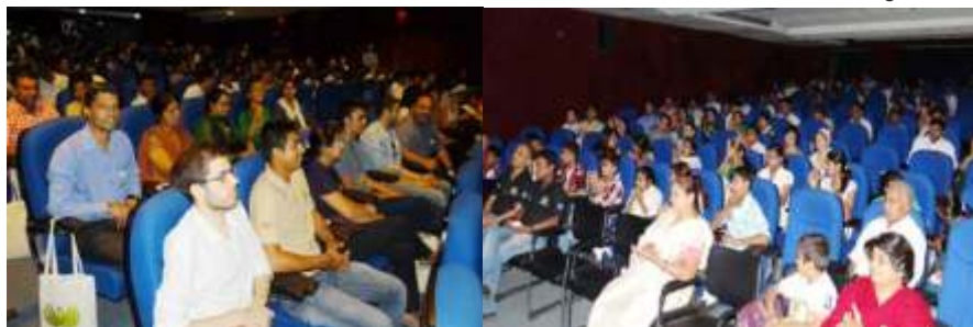
A view of participants