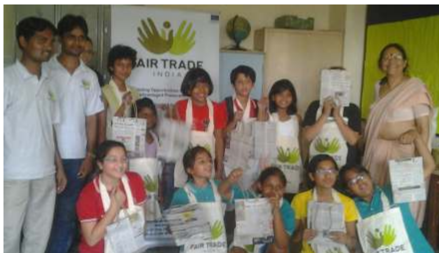
Fair Trade awareness program organised by Calcutta Rescue

Three awareness programs on 'Fair Trade and Sustainable Consumption' were organized by FTF-I in association with its members between March and May 2013.