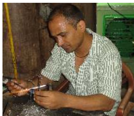
FK Fellow undergoing training in a glass producing group

merchandising and corporate gift marketing. They were also given hands on training on Fair Trade promotion in campuses.