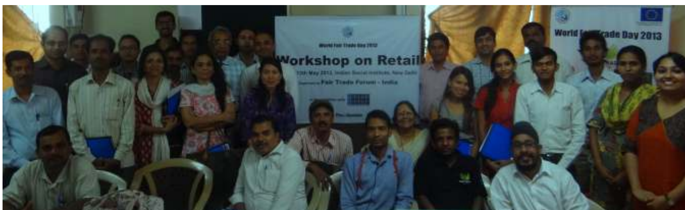
Group photo: Participants and facilitators of the workshop

Kumaon Grameen Udyog, The Ants, Literacy India, Purkal Stree Shakti, Sasha, Anwasha, Orupa, Kalatmak handicrafts, Silence, Arunim, Calcutta Rescue, JKSMS, Sanskriti Expressions, Shantimalai Handicrafts, Sadhna and Sahaj