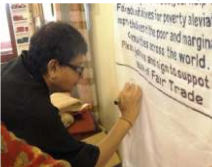
Noted film maker (late) Rituparno Ghosh signing in support of Fair Trade