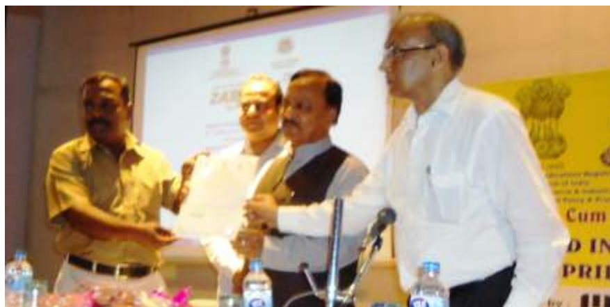
Certificate showing GI status of Lucknow Zardosi being released

The state of Uttar Pradesh is blessed with many traditional clusters which have developed over several decades. These clusters are now the cultural heritage as well as economic drivers in their respective