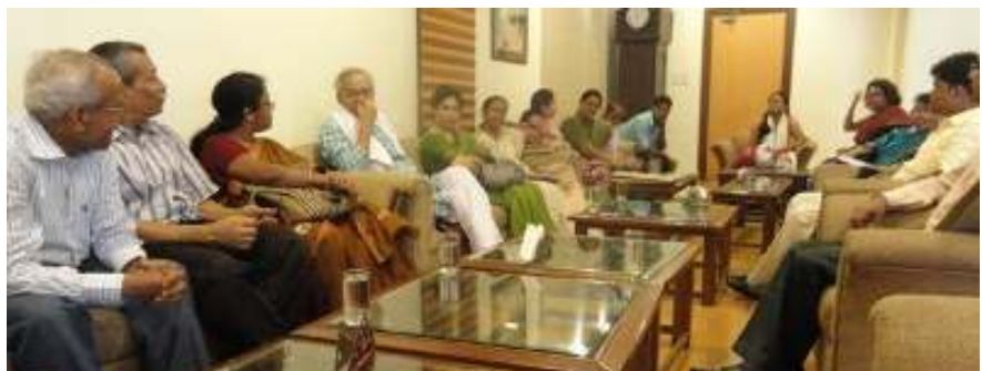
Meeting organised at Saturday Club

on 11th May 2013. It was a fun-filled day with music, games, food, signature campaign, tree planting and many more activities.