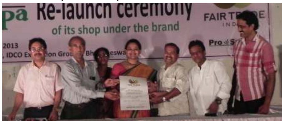
FAIR TRADE INDIA brand certificate being presented to Orupa team