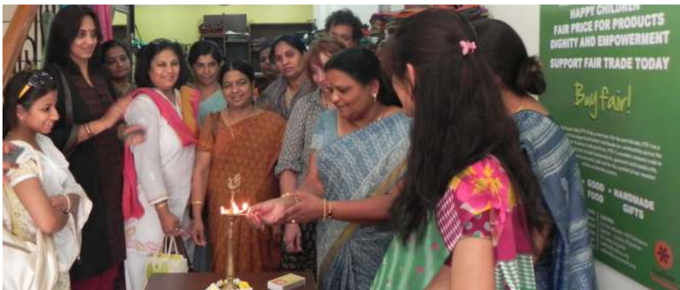
Formal opening of Sadhna's FAIR TRADE INDIA brand promotion program in the shop at Jagdish temple road, Udaipur

The FAIR TRADE INDIA brand stands for the shops which sell fairly produced products in India. So far 25 shops have come under the brand. Currently the brand is given only to the shops owned by Fair Trade producing or marketing organisations who are members of FTF-I. In the last financial year the turnover of shops crossed Rs.11 crores. At present, artisans, farmers and workers associated with 53 Fair Trade organizations are getting benefitted from the 25 FAIR TRADE INDIA branded shops.