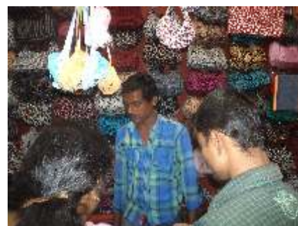
A stall in the Adivasi Mela

colorful festival of tribal people where all the 62 tribes from Orissa come over to the exhibition ground to spread out their ethnic mosaic. Adivasi Mela - the ethnically vibrant cultural festival, the only one of its kind in the country, is one of the most attractive agenda of SC and ST Development Department of Orissa government.