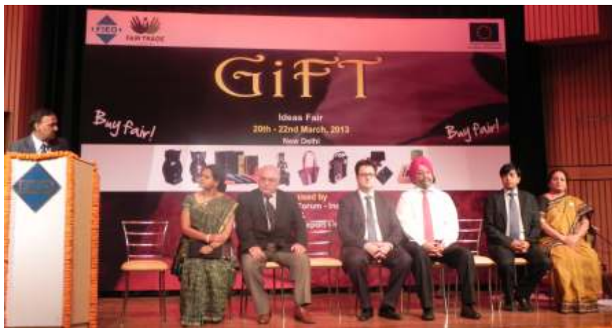
Inaugural session of GiFT Ideas Fair

Sixteen members of FTF-I participated in the Fair. Handicrafts made of wood, stone, terracotta, ceramic, glass, metal, paper, natural fibre, recycled materials, fabric and food products such as jams and fruits' jelly were displayed in the Fair