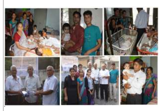
Snippets of the visit to Matrachhaya

Pushpanjali Fair Trade, Agra supported the infants in an orphanage named 'Matrachhyaya' on 23rd Sept 2013 by distributing clothes and providing baby milk powder and 3 months milk stock for the infants.