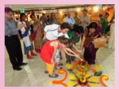
Inauguration of the Fair Trade Fair