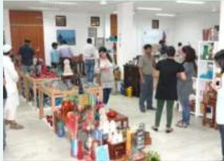
Consumers appreciating and buying crafts at solidarity sale

The Sale received good response and a number of visitors from the nearby offices and localities visited the Sale, appreciated and bought the crafts. Useful information spreading awareness about Fair Trade was exchanged between the customers and volunteers of Tara. It provided a new insight about Fair Trade to the visitors. Many took keen interest and pledged their support for Fair Trade. They were also informed about other Fair Trade Shops and Fair Trade India Brand. The event also created awareness about the Socio-Economic projects of Tara and El. The crafts worth more than INR 2,50,000/- were sold during the Festival cum Solidarity Sale in two weeks time.