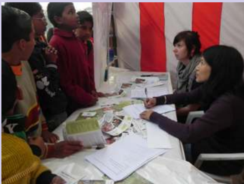
A Fair Trade Quiz session in progress

Members of FTF-I participated in the Fair of green products as part of the carnival. Six Delhi based member organizations from FTF-I participated in the Fair. A catering competition and fashion show with natural and sustainable products were also organised as part of the carnival. Large number of people interested in green consumption turned up for the Fair. Representatives of FTF-I interacted with consumers, students, teachers and representatives of government departments.