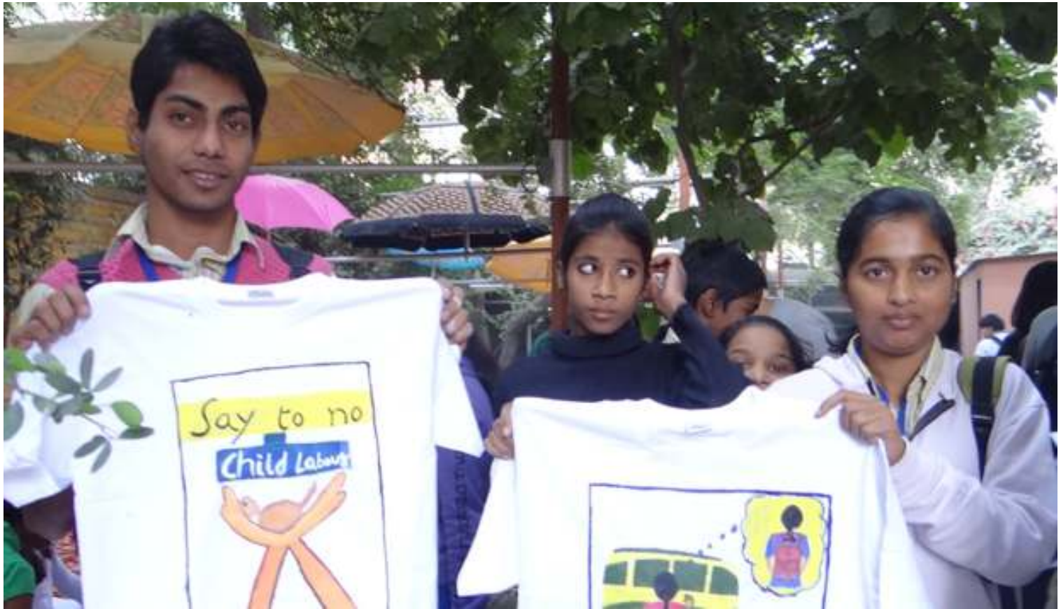
Participants of the T-Shirt painting competition on Child Labour with their designs

'Fair Trade Fortnight 2012' the nationwide celebration to promote Fair Trade was organised from 20 th November to 4 th December 2012. The celebrations were supported by the European Commission under the ProSustain project. The FAIR TRADE INDIA shops organized Fair Trade promotional programs, special displays, small fairs and coffee meets to interact with consumers.