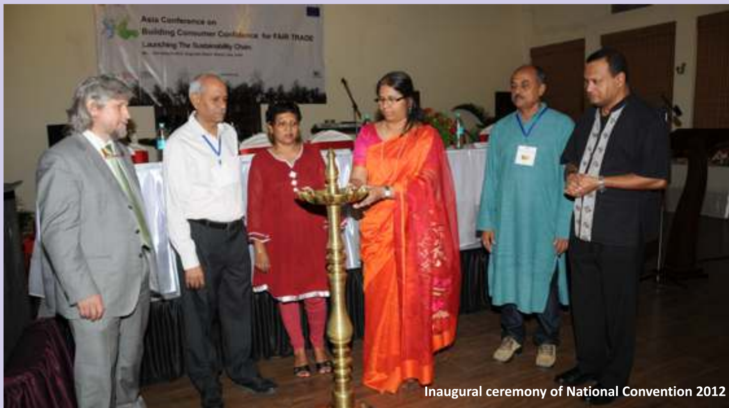
Inaugural ceremony of National Convention 2012