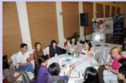
A group session