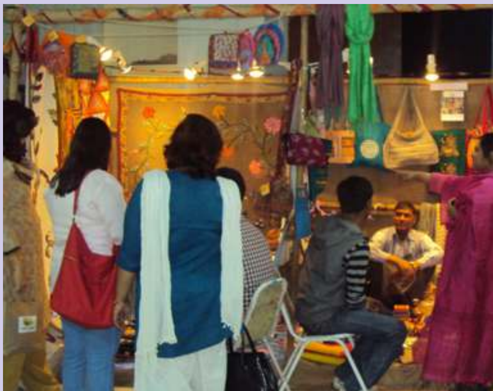
Top left: Customers in the JKSMS stall at the Fair Trade Fair. Top right: An artisan explaining about his craft. Left below: A young consumer. Bottom: MESH stall

Sadhna, ESAF, Purkal Stree Sakti, Agroweaves Weaving, Calcutta Rescue, JKSMS, Shanthimalai Handicrafts, Literacy India, CSWS-India, SIPA, Industry Crafts, Fair Deal Crafts, Sahaj, Sabala, Orupa, Shilpa, TRIFED, Mesh, Silence, Unnayan Sanshtan, The Ants and Aparajita Trust.