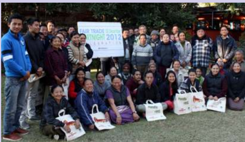
The Fair Trade Fortnight celebration was organized by IMEX on 05 December, 2012