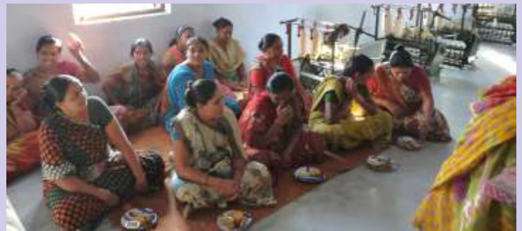
MORALFIBRE celebrated Fair Trade Fortnight