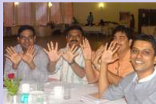
Hands up for FAIR TRADE INDIA

About 250 participants hailing from different Asian countries (including CEOs, activists from Fair Trade organisations), Board members of WFTO & WFTO Asia, media persons and Fair Trade producers (artisans & farmers) participated in the conference.