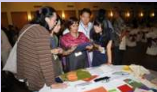
A view of product display

Conference Secretary expressed vote of thanks for the presenters and facilitators.