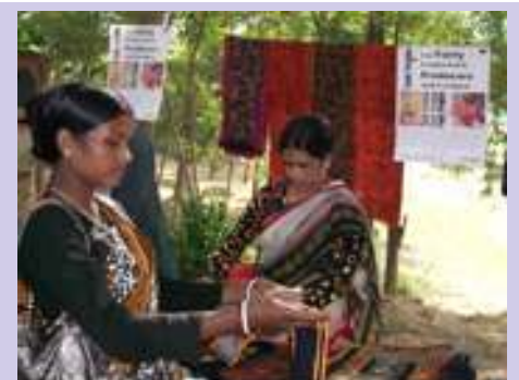
Left: Competitions for students organised at New Delhi. Right: Product display cum sale organised at Bolpur