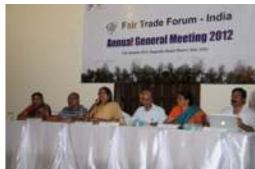
AGM of FTF-I