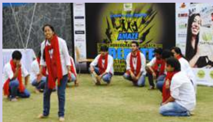
A street play competition organised at IIPM

In IP convent school FTF-I organized a 'Fair Trade talk' with students on 19th December. Fifty students took part in the session. On the same day, another awareness programme was organised at IP Modern School. Around 75 students