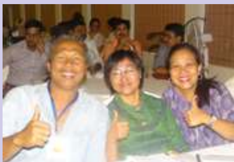
Delegates from Indonesia

Rodrigues in her inaugural address commended the efforts being taken up by Fair Trade movement globally as well as in India to extend sustainable livelihood options for the marginalised artisans and farmers. She urged the Fair Trade fraternity to explore taking up regular Fair Trade initiatives in Goa to support deserving producers as well as introducing local products to consumers and especially the visitors coming in to Goastate.