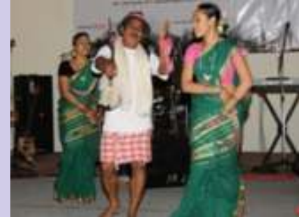
Folk dances by artists from Goa

Rodrigues in her inaugural address commended the efforts being taken up by Fair Trade movement globally as well as in India to extend sustainable livelihood options for the marginalised artisans and farmers. She urged the Fair Trade fraternity to explore taking up regular Fair Trade initiatives in Goa to support deserving producers as well as introducing local products to consumers and especially the visitors coming in to Goastate.