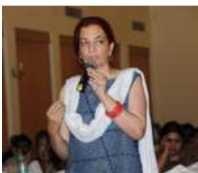
A delegate from Pakistan