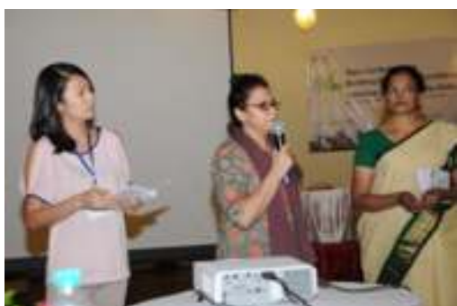
A view of product display

Annual General Meetings (AGMs) On 11 th October the AGM of FTF-I, 'WFTO Global discussion with Asia Members' and AGM of WFTO Asia were organised. On 12 th October the AGM of WFTO was organised. New Office bearers of Fair Trade Forum – India and WFTO Asia were also elected in their respective AGMs.