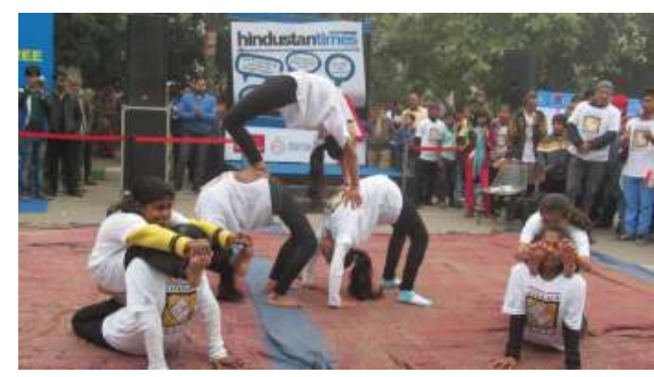
Students of Literacy India performing at the Republic Day and Raahgiri event

Literacy India, New Delhi and JKSMS, Jaipur celebrated the 65th Republic day with a great zeal and pomp and splendor. Literacy India this year clubbed its Republic day programme with 11th Raahgiri Day. After the Flag hoisting there was a procession by Literacy India children in colorful costumes. The students also performed a yoga and aerobics based dance on the song 'Jai ho', 'Chiriya mar qulel' a short street drama on girls education and a dance choreograph named 'Army dance', to show gratitude towards all defense personnel. various media like Hindustan Times, Times of India and Radio channel Gurgaon ki awaz covered the programme. JKSMS celebrated the Republic Day with 'Apna Ghar' children. The programme included flag hoisting, dance performances by children and a good time of sharing.