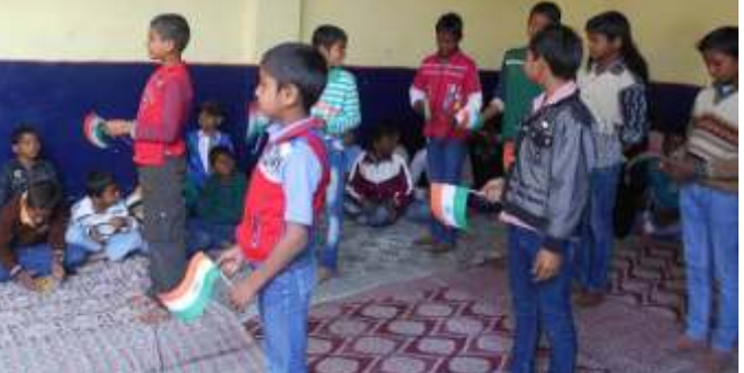
Children of 'Apna Ghar', JKSMS performing in the Republic Day program