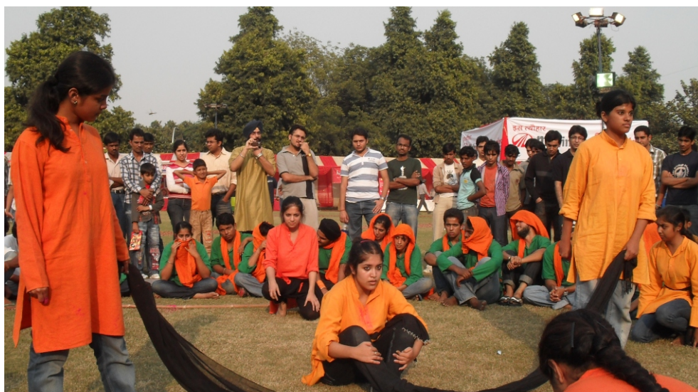
Street play competition organised at the Management Development Institute (MDI) based on the themes related to Fair Trade principles collage students