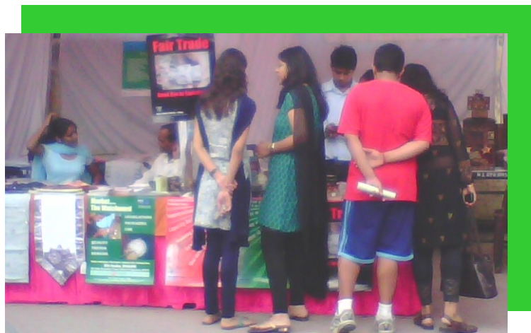
Craft display cum sale organised at St. Coumba's School, New Delhi