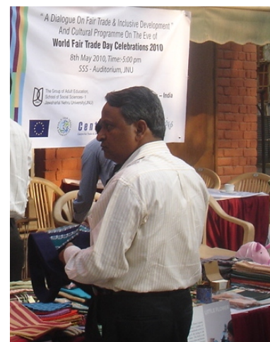
Craft display and sale organised at JNU, New Delhi