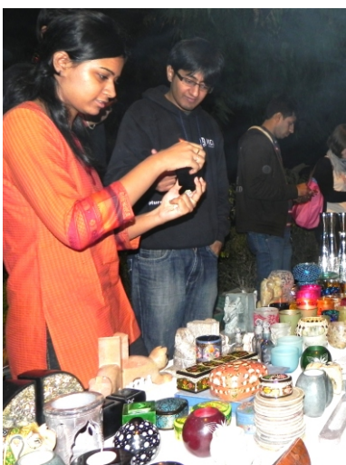
Craft Display and Sale in MDI, Gurgaon

FTF-I facilitated participation of our member organizations in Sans Paniel a marketing project conceived by the students of Business Administration studying at the Management Development Institute (MDI), Gurgaon. Three member organizations took part in this activity.