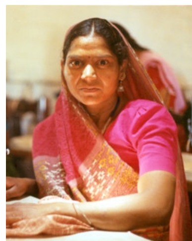
An artisan from SEWA TFC