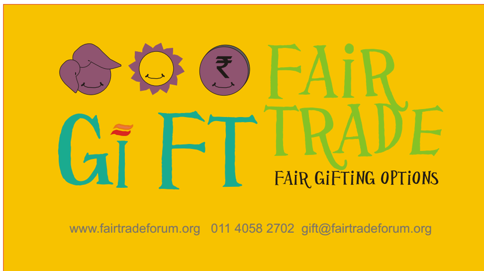
GiFT Fair Trade logo