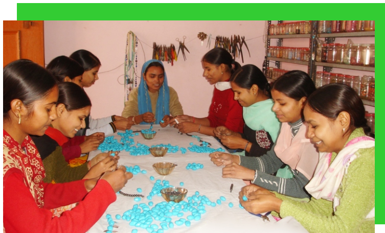
Fair Tourism provides opportunity to understand the craft and traditions of India the visitors