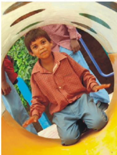
A child at Literacy India's School