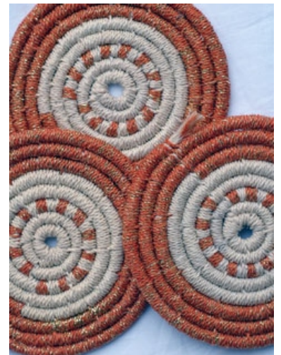
Products made of natural fibre