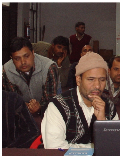
Fair Trade Training organised in Noah's Ark

The first phase of eleven pilot projects under SFTMS (Sustainable Fair Trade Management System) has been completed and this will be soon integrated with the monitoring system being promoted by WFTO. The Entry Audit procedures were made further simple as part of membership process of FTF-I. FTF-I is also in the process of giving an enabling environment for the member organizations to help them to explore other product specific options of certification. In this regard, FTF-I has already invited representatives of FLO (Fair Trade International) and Shop for Change to various programs being organized by FTF-I. Besides this, as part of the branding initiative for Fair Trade Shops, a set of guidelines for retail organizations is also being developed by FTF-I.