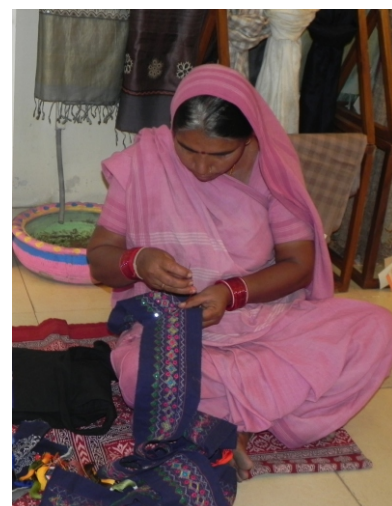
An artisan from SEWA Ahmedabad showing her skills

During the year two government promoted organizations, TRIFED and Arunim have applied for membership in FTF-I.