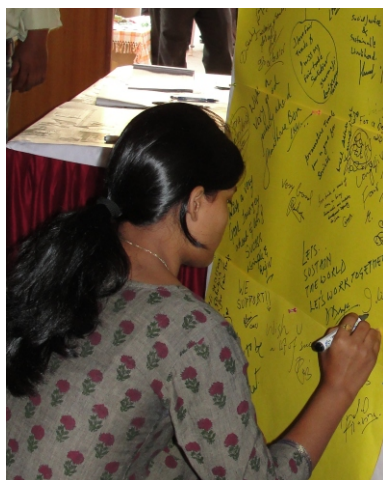
A student signing for Fair Trade