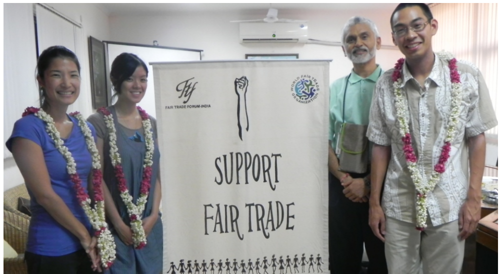
Students from University of Hawai