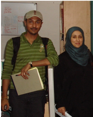
Visitors from SMEPS, government of Yemen

Seven groups of tourists, from Italy and United States visited FTF-I during the year. The groups visited three Fair Trade organizations including FTF-I, SEWA-Lucknow, Tara Projects and Pushpanjali Fair Trade.