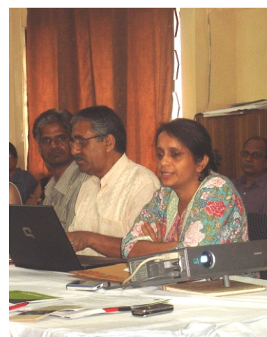
From seminar on 'Fair Wage Policy' at New Delhi

An Alliance Building program was organised in Puducherry as part of the 30th year celebrations of SIPA on 27th January 2011. FTF-I members and several potential members from the southern region took part in the seminar.