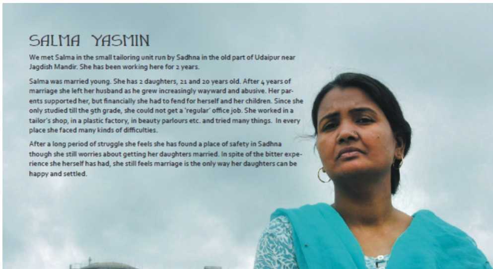
From the case study of 'Sadhna' prepared under WIEGO project

After a long period of struggle she feels she has found a place of safety in Sadhna though she still worries about getting her daughters married. In spite of the bitter experience she herself has had, she still feels marriage is the only way her daughters can be happy and settled.