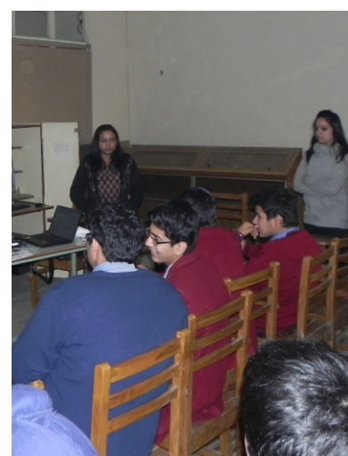
Fair Trade awareness programs at Blue Bells Schools, New Delhi