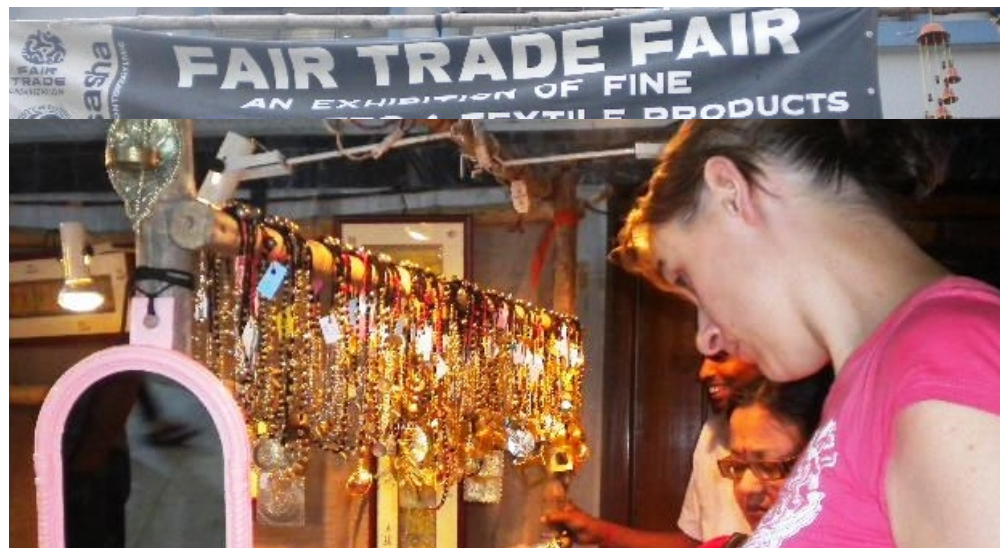
Fair Trade Fair2010 Organised in Kolkata