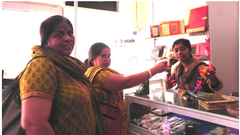
Consumers at FTF-I stall in India International Trade Fair 2010