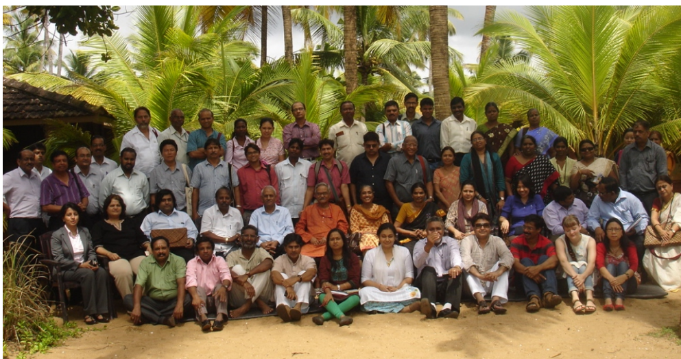
Participants of National Convention 2010