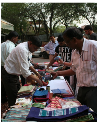
Craft display cum sale organised at Jawaharlal Nehru University, Delhi