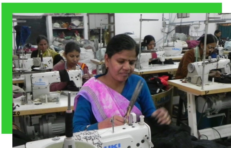
Artisan at work at Sadhna

During the year, Asha Handicrafts Association has become Asia's first SFTMS v2 certified FTO.