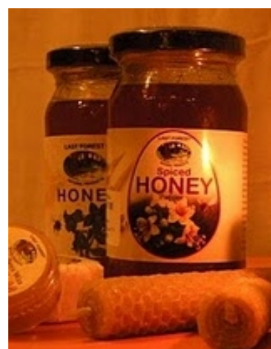
Products from Last Forest