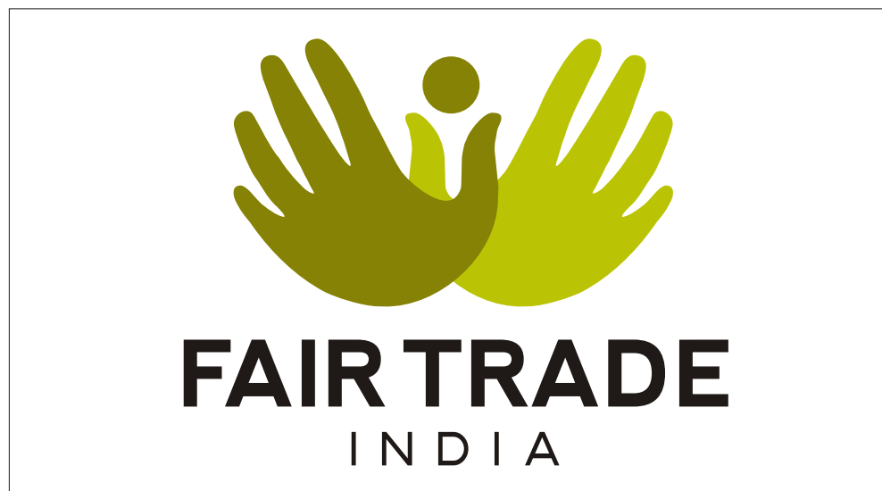
Umbrella Brand Logo