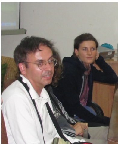
Visitors from Italy

In addition to FTF-I's initiatives in this regard, many of our members are also involved in tourism based on Fair and eco-friendly concepts.