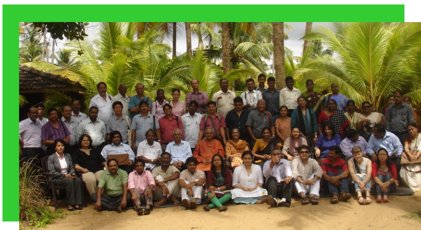
Participants of National Convention 2010