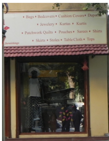
Sadhna Shop, Udaipur

“Fair Trade India” Umbrella Brand for Fair Trade Shops has been developed with the support of European Union under ProSustain project, being implemented in India by Fair Trade Forum India, HIVOS, IRFT and SFC. The soft launch of brand will be done on 14 th May, the World Fair Trade Day as part of the initial phase of brand-launch. “Fair Trade India” branded shops will join the family of other Fair Trade shop networks such as “World Shops,” which have become the synonym for “Fair and Exploitation-free Consumption” in Europe.