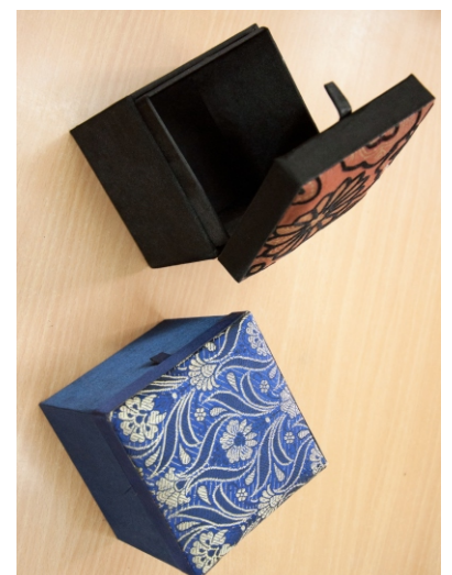
Utility oriented, embroidered products