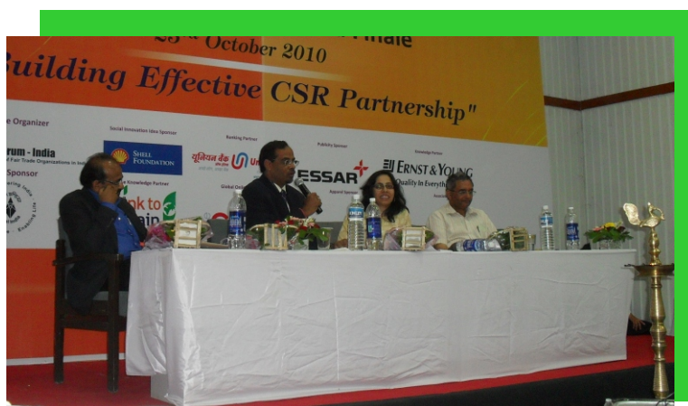
CSR Conclave, October 2010 at Bhopal