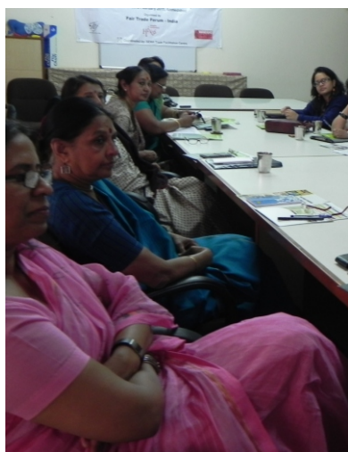
Gender policy workshop, organised at Ahmedabad

Several issues related to Fair Trade such as Fair Wages, portrayal of Women Empowerment models in Media, Role of Fair Trade in Poverty Reduction, Fair Trade and Eco-labeling, Fair Trade and Gender, Potential of Micro-level of Eco-friendly business models, Good Governance and issues related to Fair Trade Advocacy were discussed in this years' Alliance building workshops. Ministers, researchers, representatives from development organizations and CEOs from Fair Trade organizations participated in various alliance building programs.