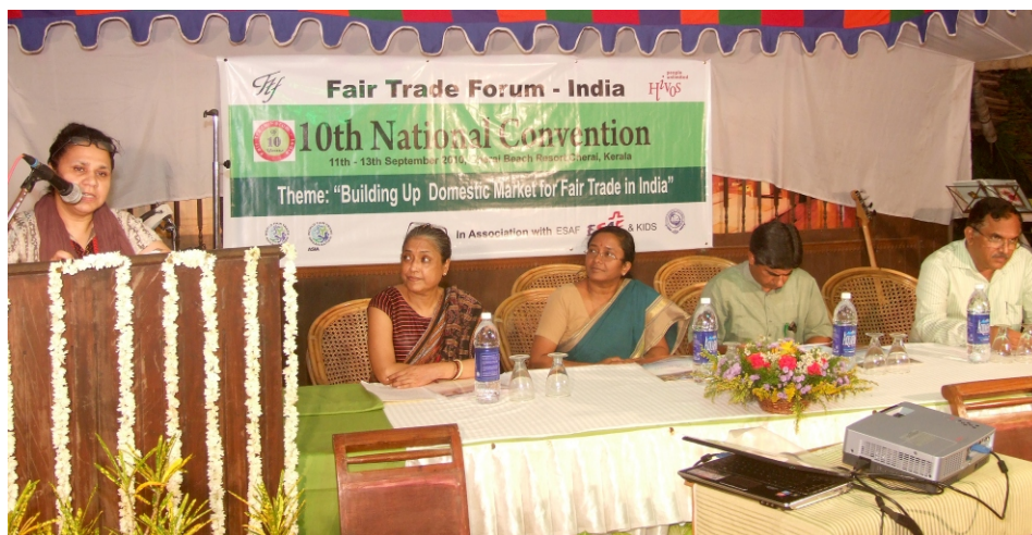
Inaugural ceremony of National Convention 2010