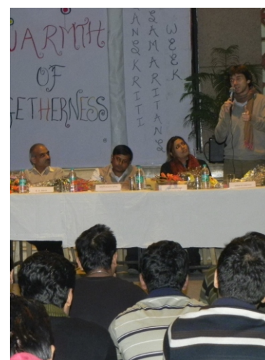
An interactive meeting with students of MDI