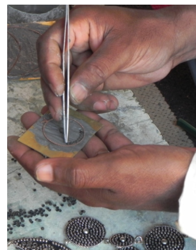
Sajai craft from Pataudi, Haryana