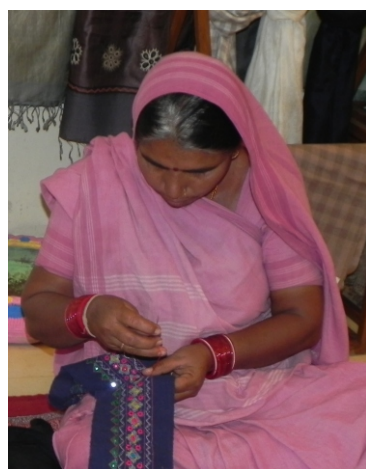
An artisan from SEWA Ahmedabad