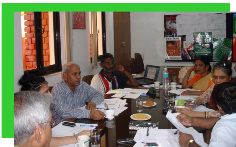
Immediate past Executive Committee of FTF-I