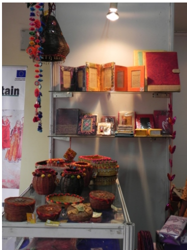
Nature friendly products on display at IITF 2010

During the year FTF-I participated in Indian International Trade Fair (IITF) and Eco Meet in association with Department of Environment, NCT of Delhi. Members of FTF-I displayed and sold products made of natural materials in both programs.