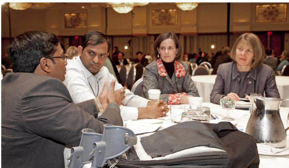
SEEP Conference 2010