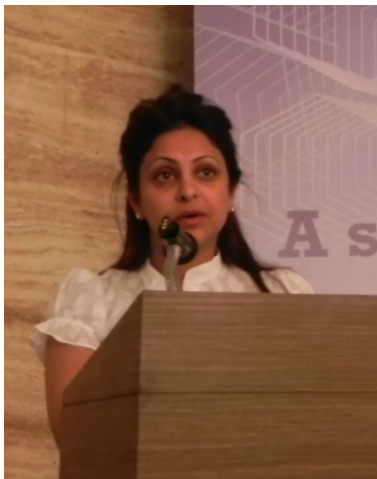
Actress Shefali Shah speaking in the ProSustain program at Mumbai