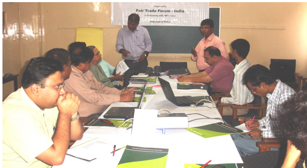
SFTMS review meeting