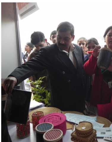
Consumers at FTF-I stall at Eco Meet

FTF-I was invited to the Fair Trade Womens' Cooperative conference organised by Kudumbashree - the state poverty eradication mission, in Thiruvananthapuram. Kudumbashree is working under the aegis of Government of Kerala. The program was organised to explore the scope of connecting women micro enterprises working under government of Kerala with the Fair Trade market.