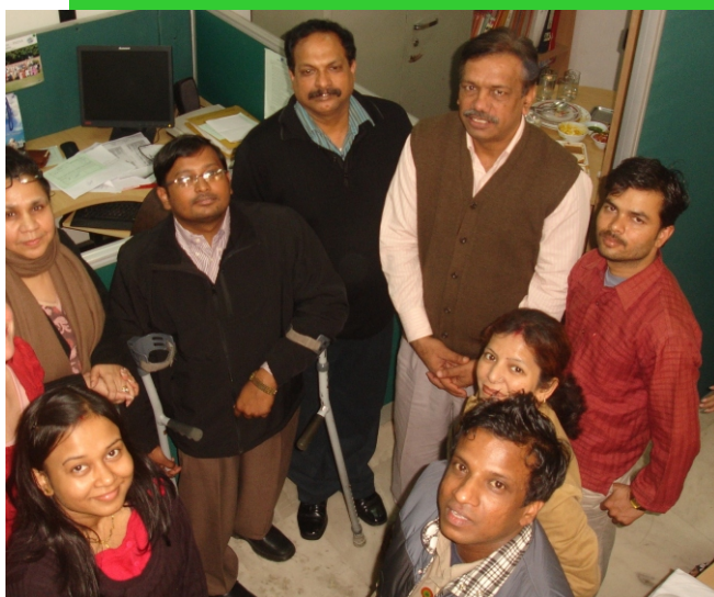
Staff team of FTF-I