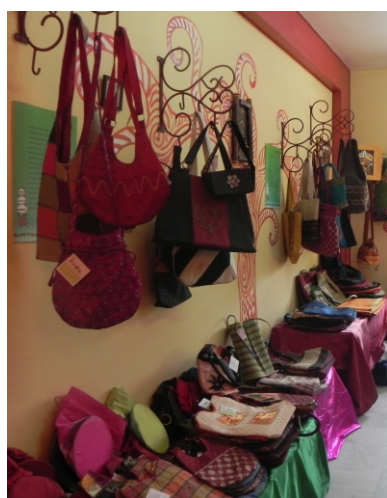
Inside view of Indha Shop, Gurgaon

Several consultation meeting with the branding advisors, working group representatives Fair Trade shops and consultants were organised as part of the branding development process. An exclusive session on branding was also organised as part of the National Convention of Fair Trade Forum - India in September 2010.