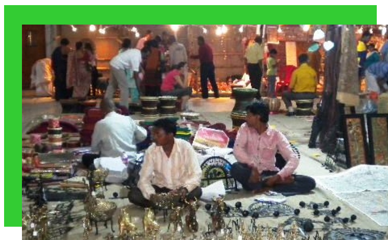
Fair Trade Fair 2011